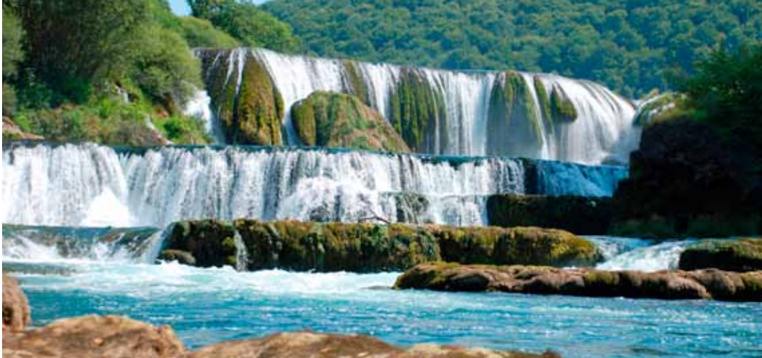
Una National Park, BiH