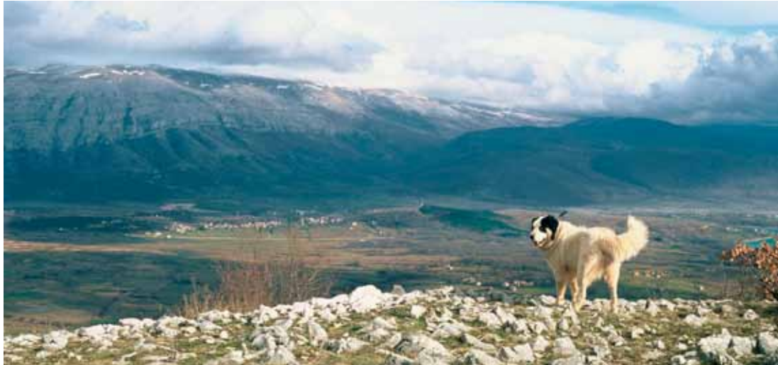
Mount Dinara, BiH/Croatia