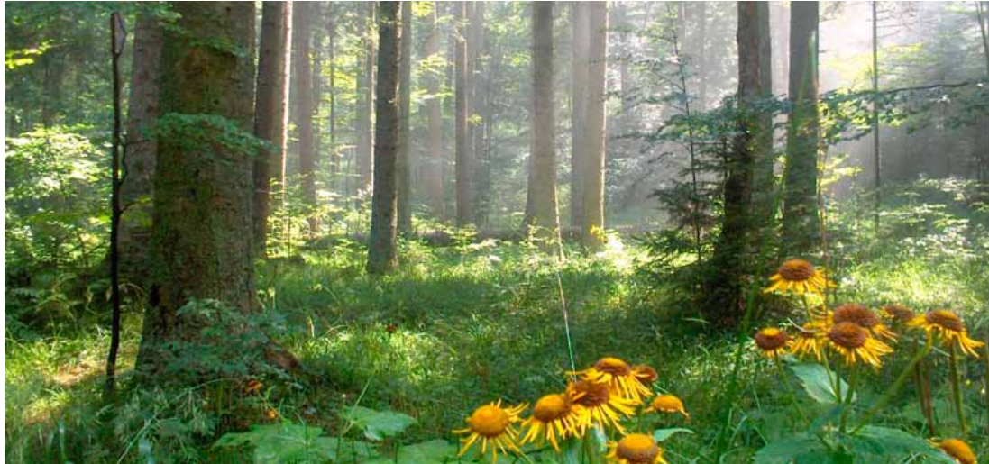
Tara National Park, Serbia