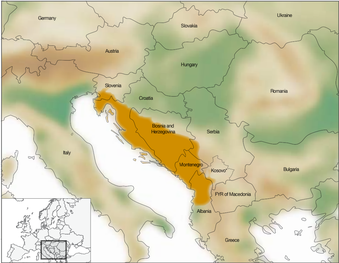
Figure 1: Position of the Dinaric Arc in South-East Europe