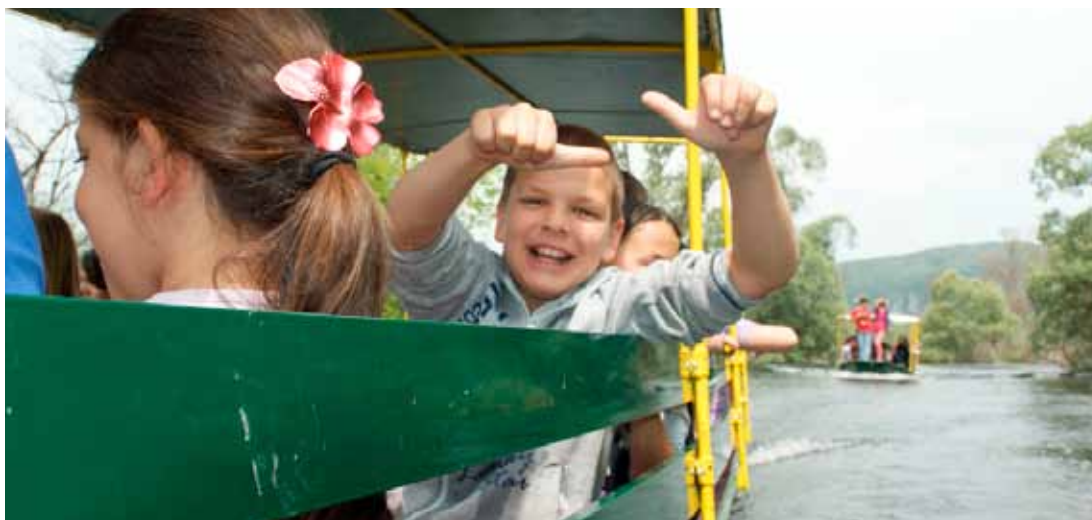
European Day of Parks, Hutovo Blato Nature Park, BiH